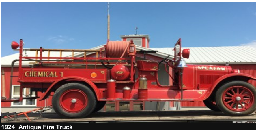
1924 Antique Fire Truck