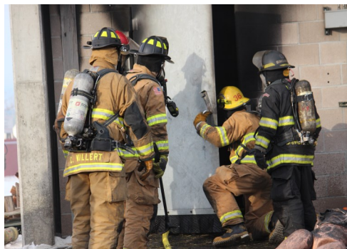
Mid Winter Fire School